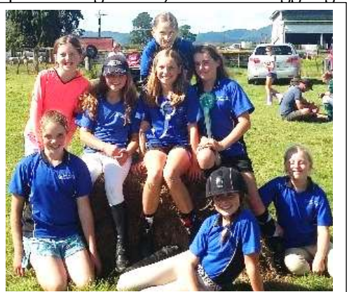
Members of the TeTeko Equestrian Team