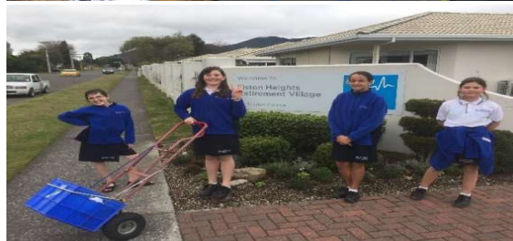
Green Team deliver Worm Tea to Residents of Liston Heights Retirement Village.