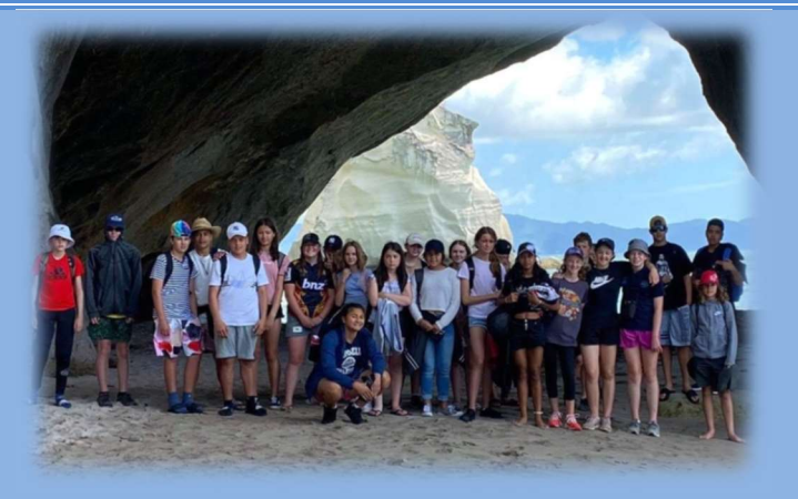
TIS – Room 2 Students enjoying camp in the Coromandel