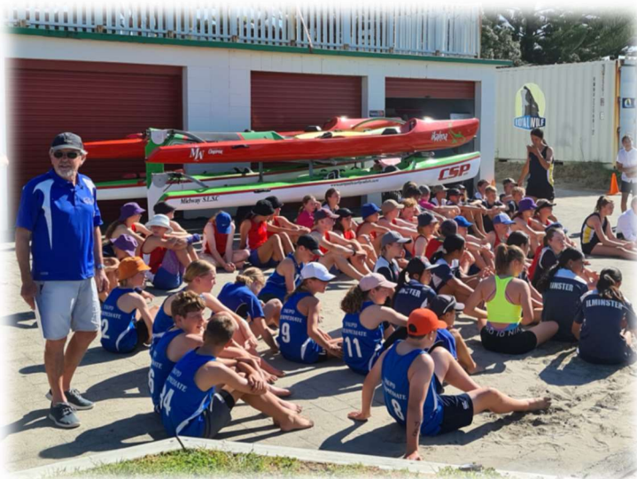
TIS - Students enjoying participating in the 'Battle of the Bays' (11th-13th November)