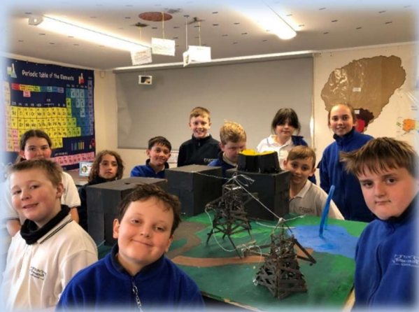
The whole geothermal team

Last week a group of Year 7 and Year 8 students designed and built a model geothermal power station to enter the GNS Science Competition. They worked tirelessly every morning tea and lunch time to complete the model by the deadline of 5pm Friday. The model included a working turbine, a water pump reinjecting water into the ground, and steamers located inside the cooling towers.