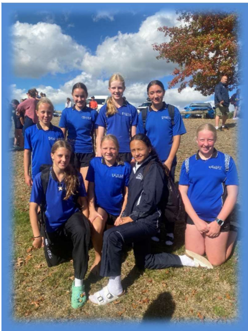
TIS Firebirds - Winners of Kiwi Sport Cricket Festival on Wednesday

Finally, thank you to all the staff and parents who have helped at all the events this term. We cannot offer so many opportunities without your support. Thank you for your patience and support as I took on this new role as Sports Co-ordinator. I have enjoyed it so much and cannot wait till next term. Have a great holiday. Keep fit and safe. See you next term which kicks off with the Kiwi Sport T Ball competition in the first week. Letters/Permission slips are available from the Sports Office.